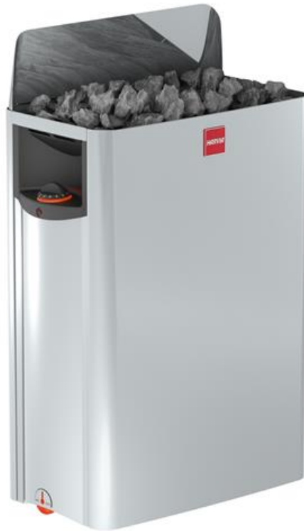
New model, The Wall (steel): Available November 2017