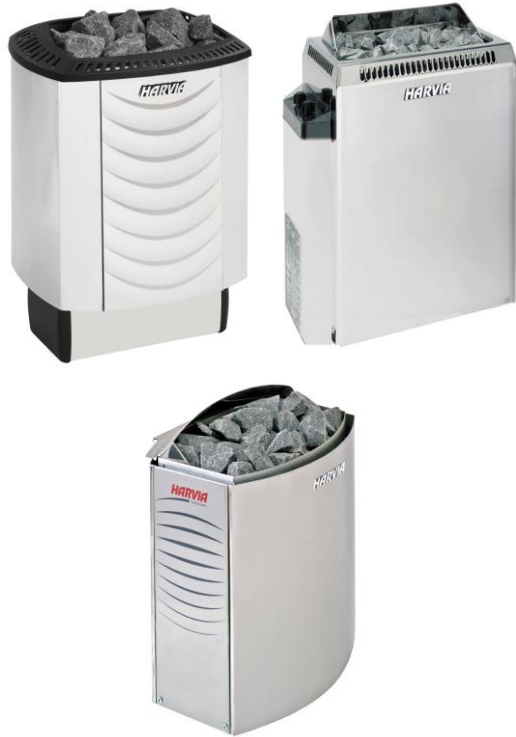
Sound, Topclass, Vega Lux models (all colors): production will end